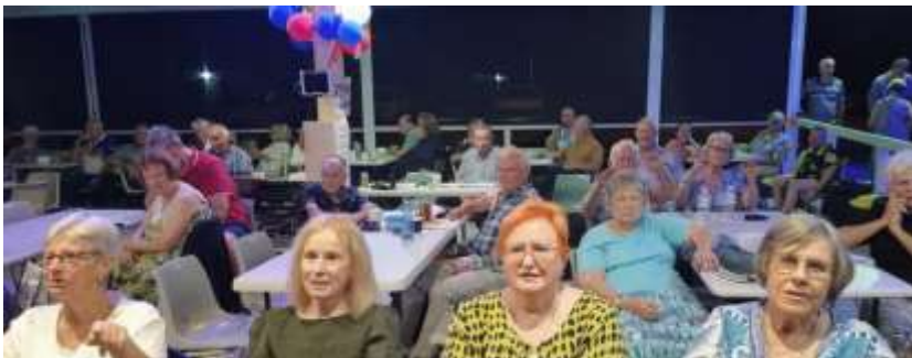
Our audience at February's social all enjoying the performers on stage. The tables were left out from the Australia Day event.