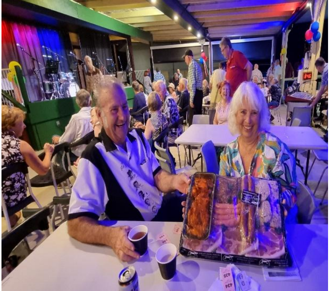
LUCKY RAFFLE WINNERS