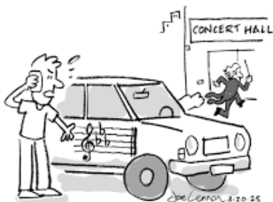
YOU'RE NOT GONNA BELIEVE THIS, HONEY. SOMEBODY KEYED MY CAR!

Marine biologists have discovered a group of killer whales that keep on meeting up and playing music together.