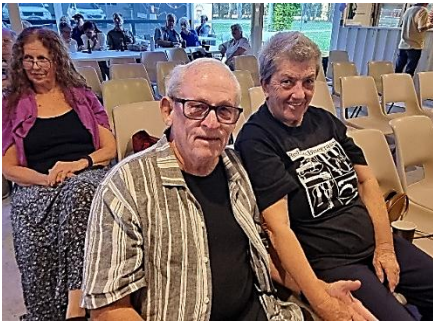
Settled in early