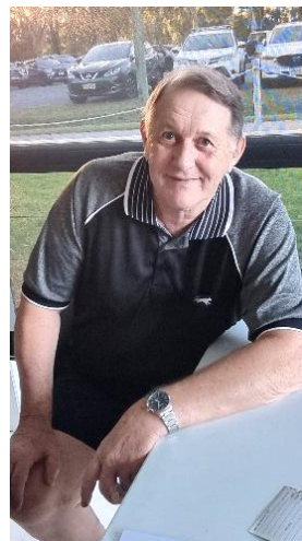
Visitors to the club are always welcome