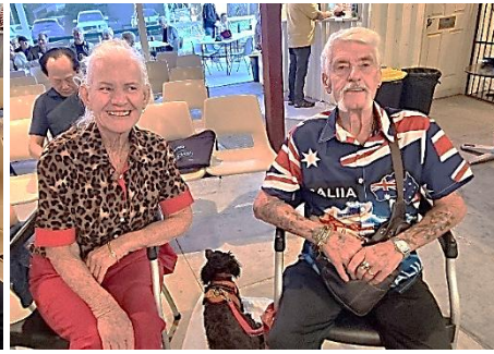
New friends to our club